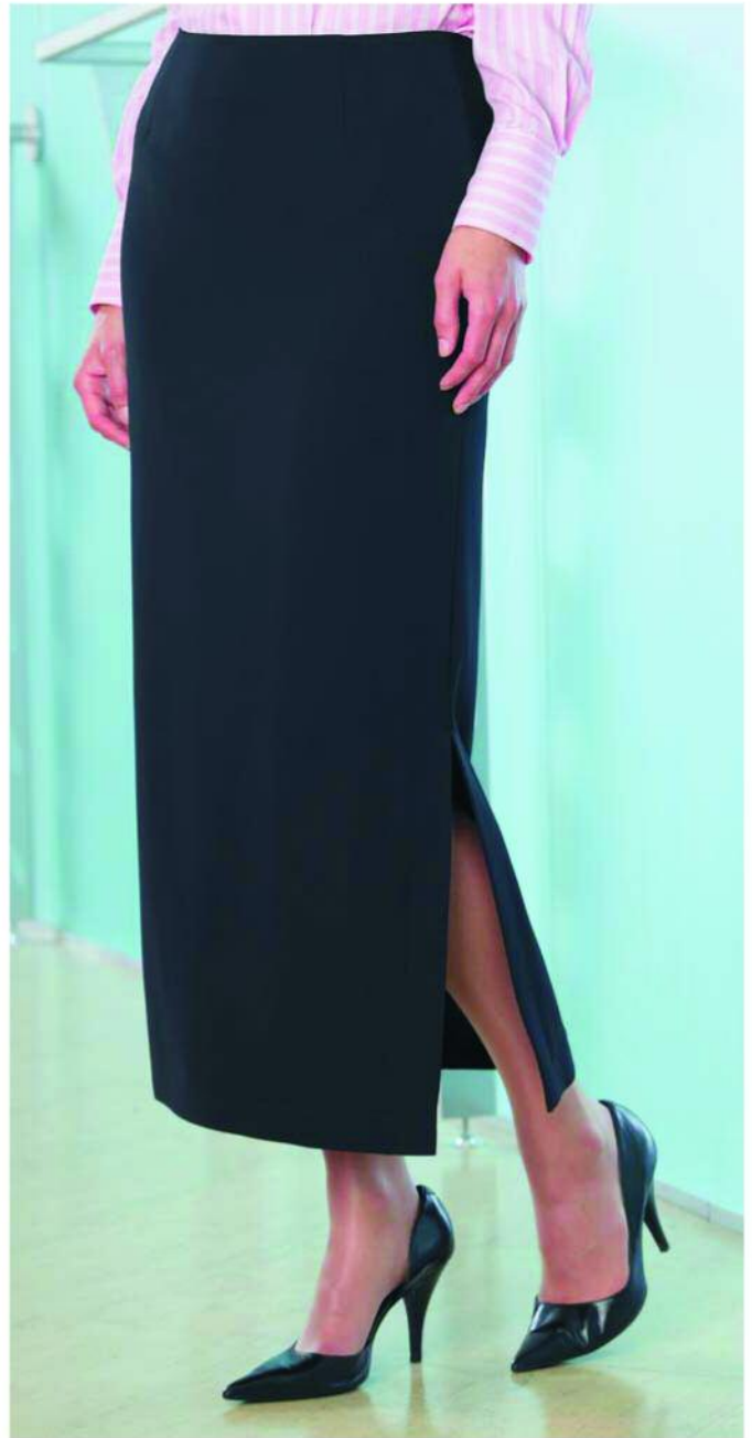
Latina Skirt , longline skirt, side vents, fully lined. Machine washable.