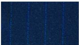
D - navy pinstripe