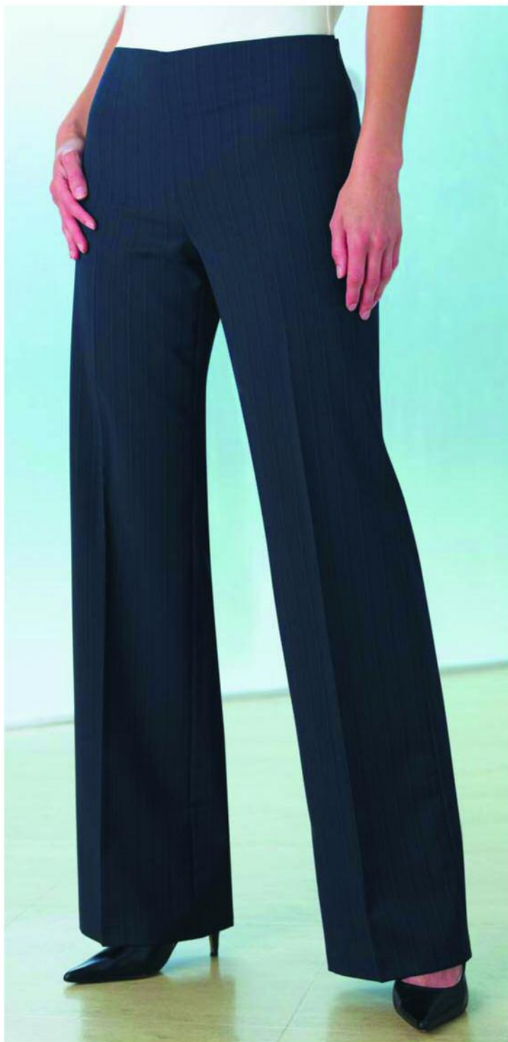
Diano Trousers, machine washable.