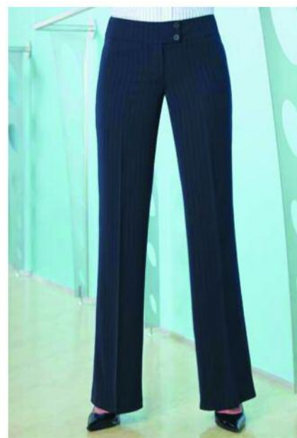
Alessandria Trousers, flared leg trouser, front fastening, machine washable.