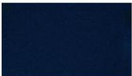
A - navy

Fabric: 100% Polyester (superfine Microfibre)