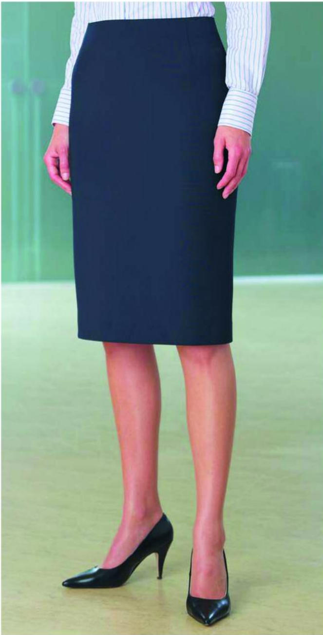
Trento Skirt , straight skirt. Machine washable.